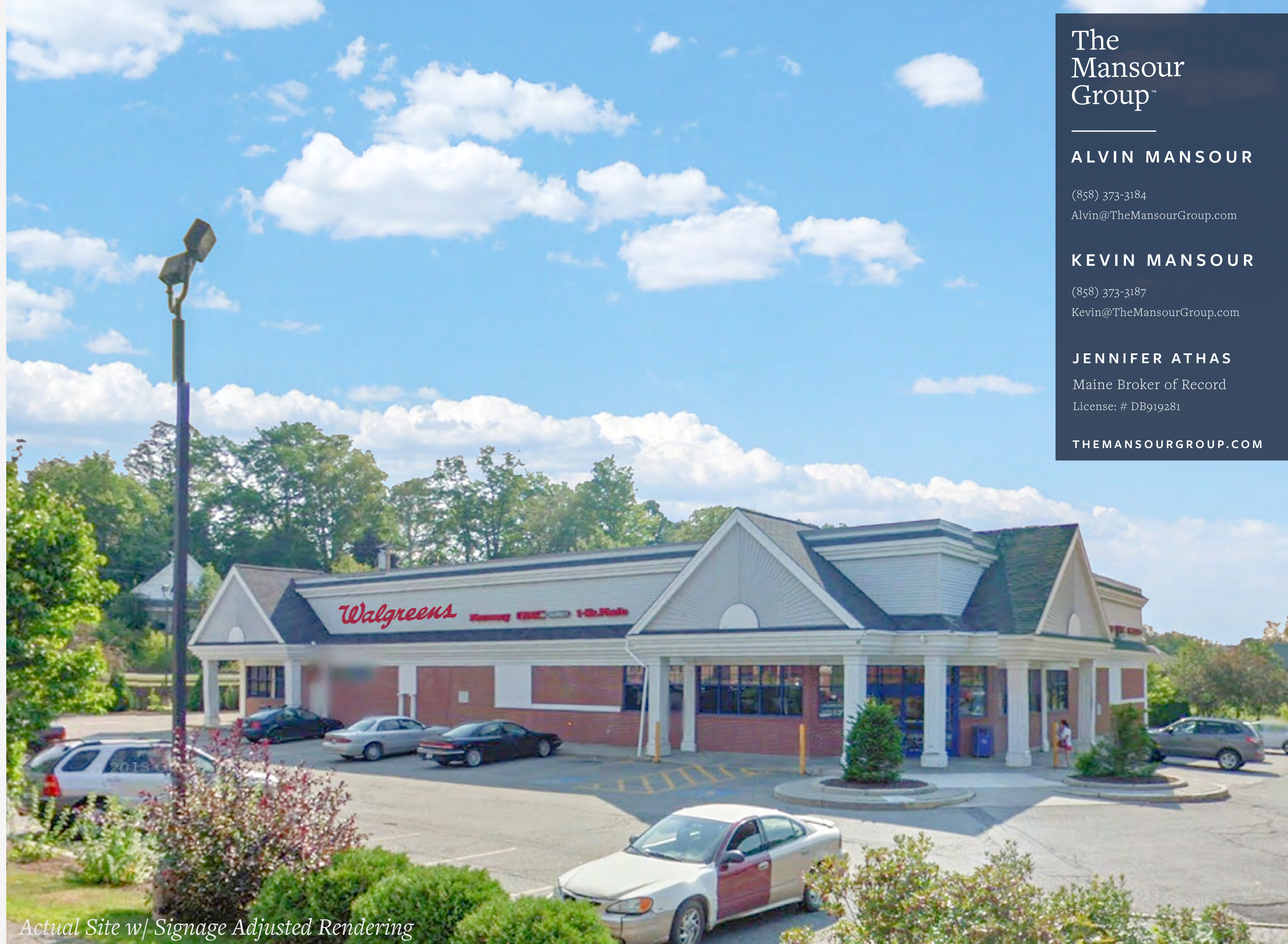
Actual Site w/ Signage Adjusted Rendering